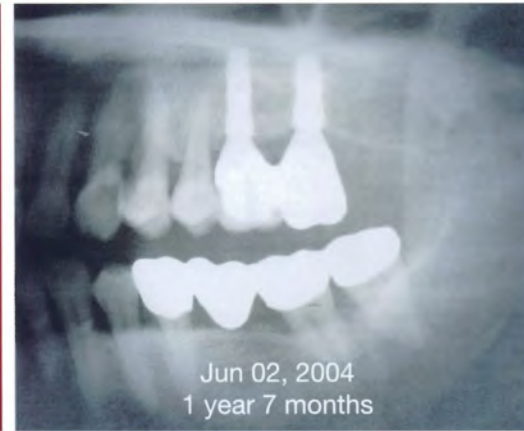
Jun 02, 2004 1 year 7 months