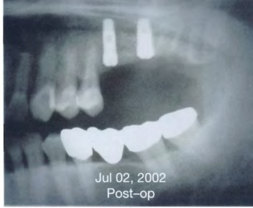
Jul 02, 2002 Post-op