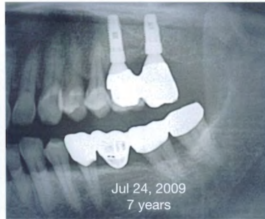
Jul 24, 2009 7 years