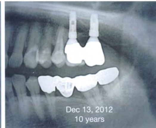
Dec 13, 2012 10 years