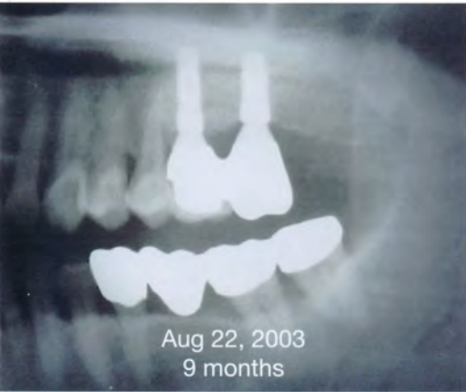
Aug 22, 2003 9 months