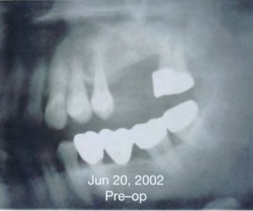
Jun 20, 2002 Pre-op