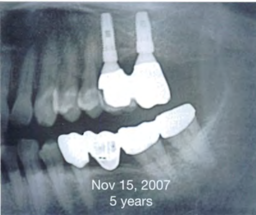
Nov 15, 2007 5 years