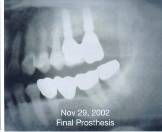
Nov 29, 2002 Final Prosthesis